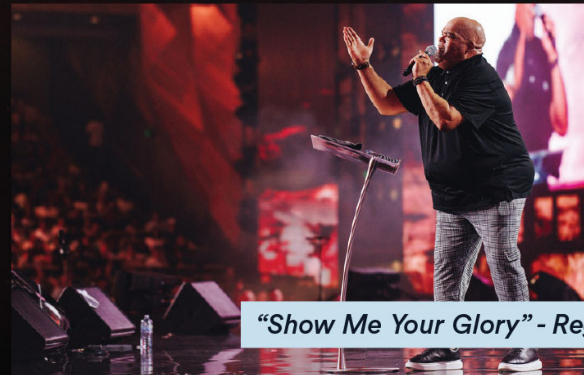
"Show Me Your Glory" - Reggie Dabbs

Discover the unexpected key to unlock the next level for your life!