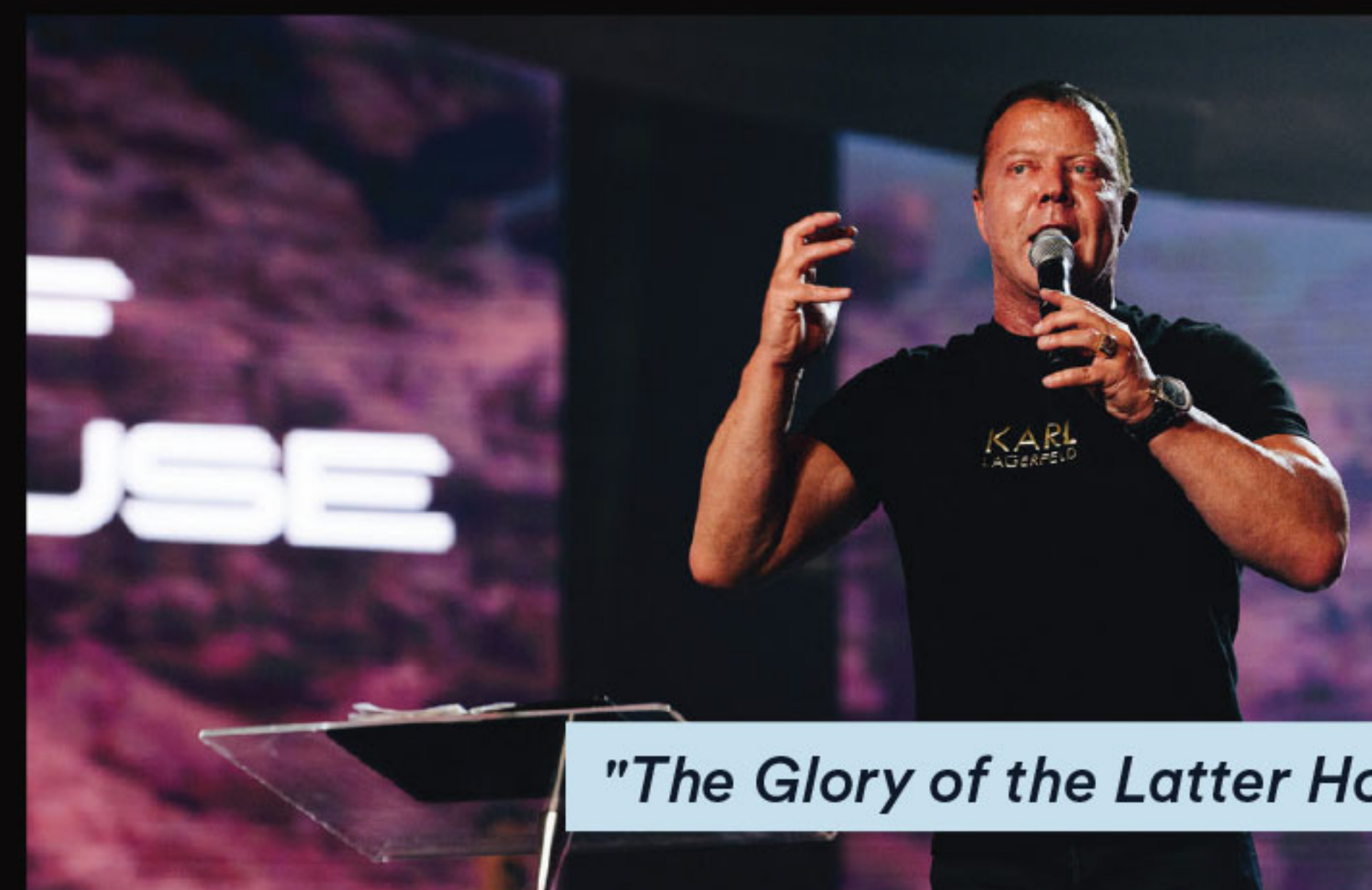
"The Glory of the Latter House"- At Boshoff

Receive this declaration that will empower you to overcome!